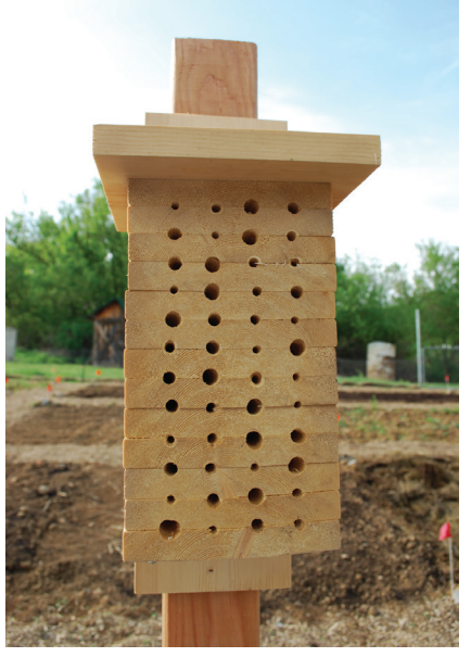
Constructed nest boxes can be used for wood nesters like the blue orchard bee.