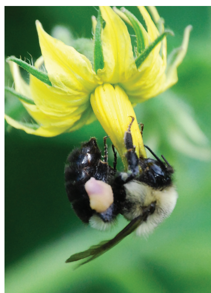
Bumble bee on a tomato flower at Penn State's community garden.

We can conserve and attract wild bee species to Pennsylvania by increasing the amount of floral resources in the area, conserving natural habitats in the landscape, providing access to clean water, creating or conserving nesting sites, and reducing bee exposure to pesticides.